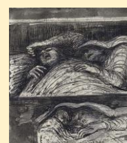
Sleeping Mother and Child Henry Moore (1898-1986)