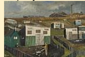
Pigeon Crees Jimmy Floyd

A pigeon cree is a shed or loft where pigeons are kept. These pigeons are usually kept as racing birds; they will be taken to distant places in baskets, then their return to the cree is times.