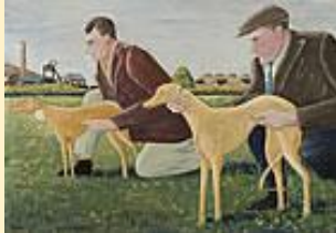
Whippets George Blessed

Whippets were popular dogs with northern mining families, sleeping in children's beds to help keep them warm and used for chasing rabbits. They were also used for racing.