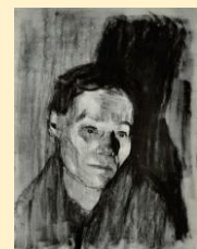
Home Worker Kathy Kollwitz (1867-1945)