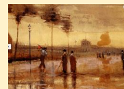
A Sunday in Einhoven (1885) Vincent Van Gogh (1853-1890)