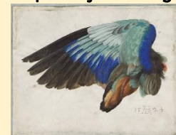
Left Wing of a Blue Roller (c1500)