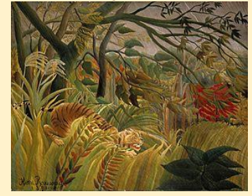
Tiger in a Tropical Storm (Surprised!) (1891)