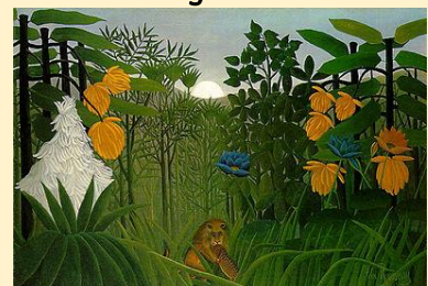
The Repast of the Lion (1907)