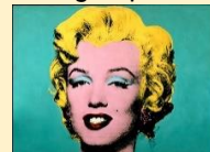
Turquoise Marilyn (1964) Andy Warhol (1928-1987)