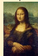
Mona Lisa (1503-1506) Leonardo da Vinci (1452-1519)