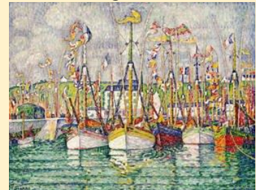
Blessing of the Tuna Fleet at Groix (1923)