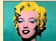
Turquoise Marilyn (1964) Andy Warhol (1928-1987)