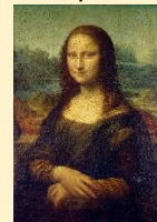
Mona Lisa (1503-1506) Leonardo da Vinci (1452-1519)