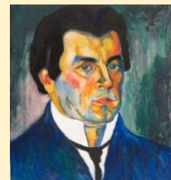
Self Portrait (1911) Kazimir Malevich (1879-1935)