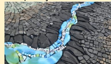
Beyond Oceans (2018) Julie Sperling