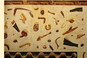
The Unswept Floor