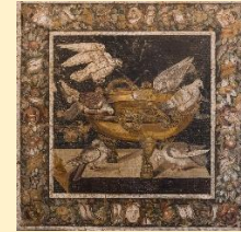
Doves Drinking from a Bowl