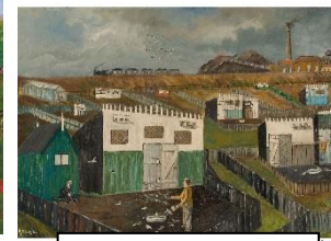
Jimmy Floyd – Pigeon Crees 1938