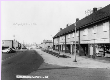
Photographs taken in 1960.