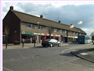
Photograph taken in 2008.