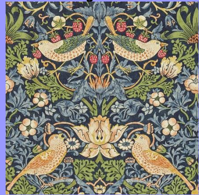
Strawberry Thief (1883)

One of his most popular designs for textiles.