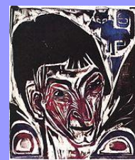
Portrait of Otto Muller (1915) Ernst Ludwig Kirchner (1880-1938)